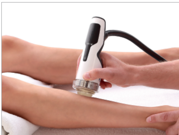
Tibial stress syndrome